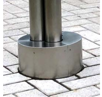
Detail of post and escutcheon plate

Highlights - This commemorative artwork stands 7' high with the artwork panel measuring 40" high by 96" wide which is comprised of stainless steel with the graphic of the Log Drivers artwork being etched around the perforated panel. The artwork panel is wrapped like a scroll around the posts. The posts are 4" in diameter, seamlessly welded and finished to match the panel with the whole display embedded below grade with concrete embeds and stainless steel bolts and capped with stainless steel escutcheon plates to match the overall finish. The lower didactic ledge panel is made from 1/4" stainless steel and attached to the panel.