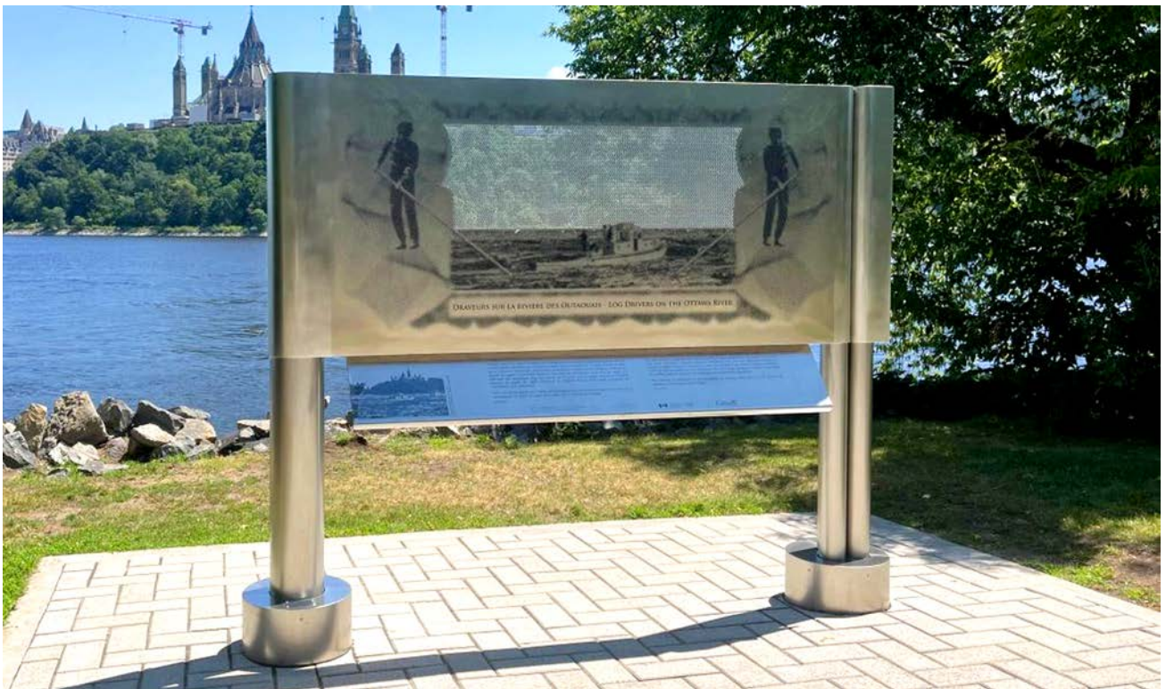
The completed commemorative artwork plaque in-situ on the Ottawa River across from the Canadian Parliament buildings