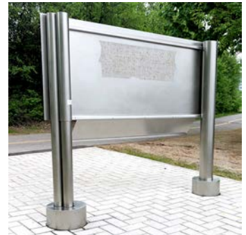
The reverse side of the commemorative artwork