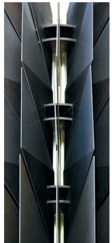
Detail of the fins attachment from the front view