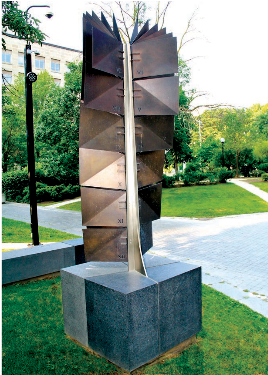
The Correctional Workers Monument "Hours of the Day"