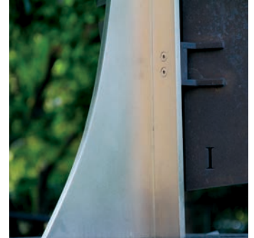
Detail of the Stainless Steel Mast

Highlights - A brushed stainless steel mast supports an array of (70) brushed and patinated fin panels. These work in unison as a part of and with the sundial on the monument base. The monument signifies the passage of time..