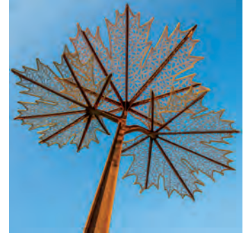
Looking up at the top of the structure

Highlights - The trees stand at approximately 12' high and are fabricated from 1/2" thick COR-TEN steel plate with exposed filled welds 4" long stitched 8" apart. The maple leaves are painted stainless steel lattice mesh work welded to the COR-TEN trunks.