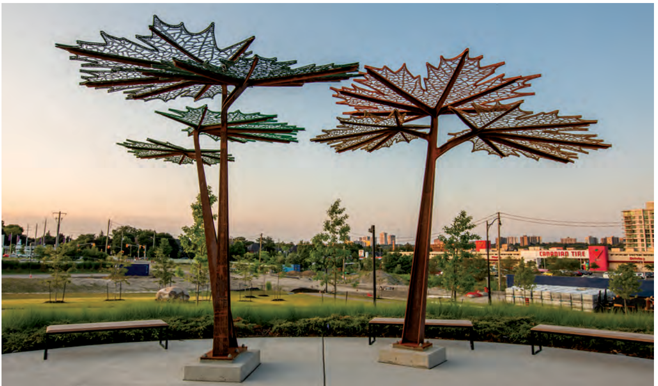
The 'Maple Leaf Canopy Trellis' public art in-situ at Woodsy Park in Toronto