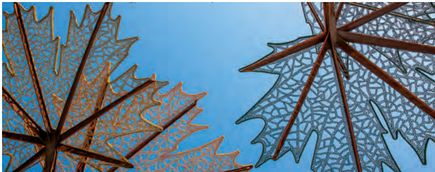
Detail of the lattice mesh work of the Maple Leaves