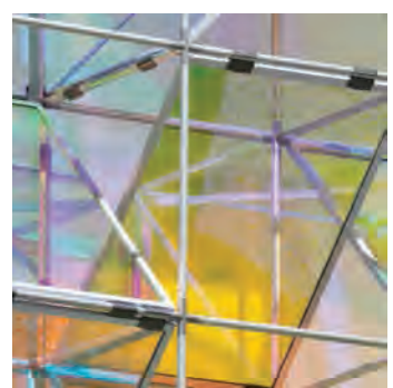
Detail of frame and lenses