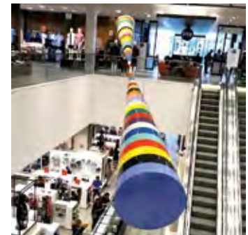
Bowtie as viewed from above