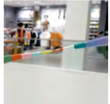
Detail at centre of balance on Bowtie

Highlights - The piece was carefully engineered to meet the artist's requirement that the Bowtie be suspended only from (2) stainless steel aircraft cables. The centres of gravity were determined perfectly, so the cone tips meet using a concealed stainless steel inner rod that hold the two cones in position.