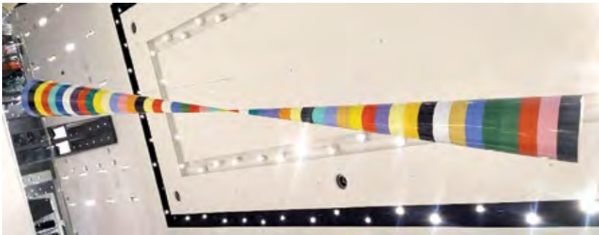
Bowtie as viewed from below while on the escalator