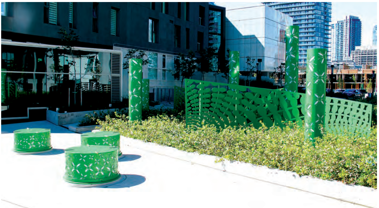
“Variegation Courtyard” Public Art at Concord Cityplace