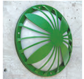
One of the Ten, 15 1/2” diameter light sconces