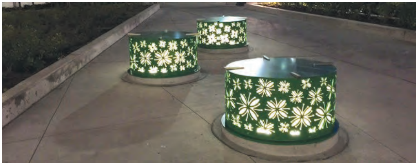
The benches, internally illuminated, as viewed at night.