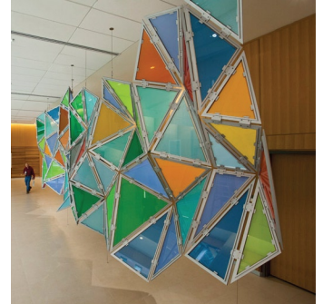
A view of the front of the artwork

Highlights - The artwork, entitled "Hive Brane" is 4 meters high by 10 meters long and 2.5 meters deep (12.5 feet high x 33 feet wide x 7 feet deep) and is constructed of 114 uniquely shaped isosceles triangle frames, fabricated in painted aluminum, within which is installed a palette of 14 colors of translucent custom-colored glass.