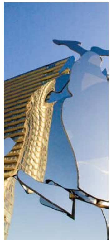
Detail of the mirror polished cladding