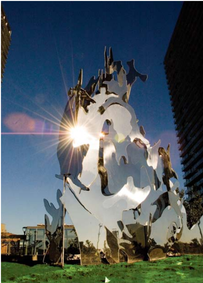
The sculpture in-situ at the NXT condominiums.