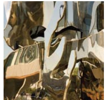
Detail of the plates and cladding