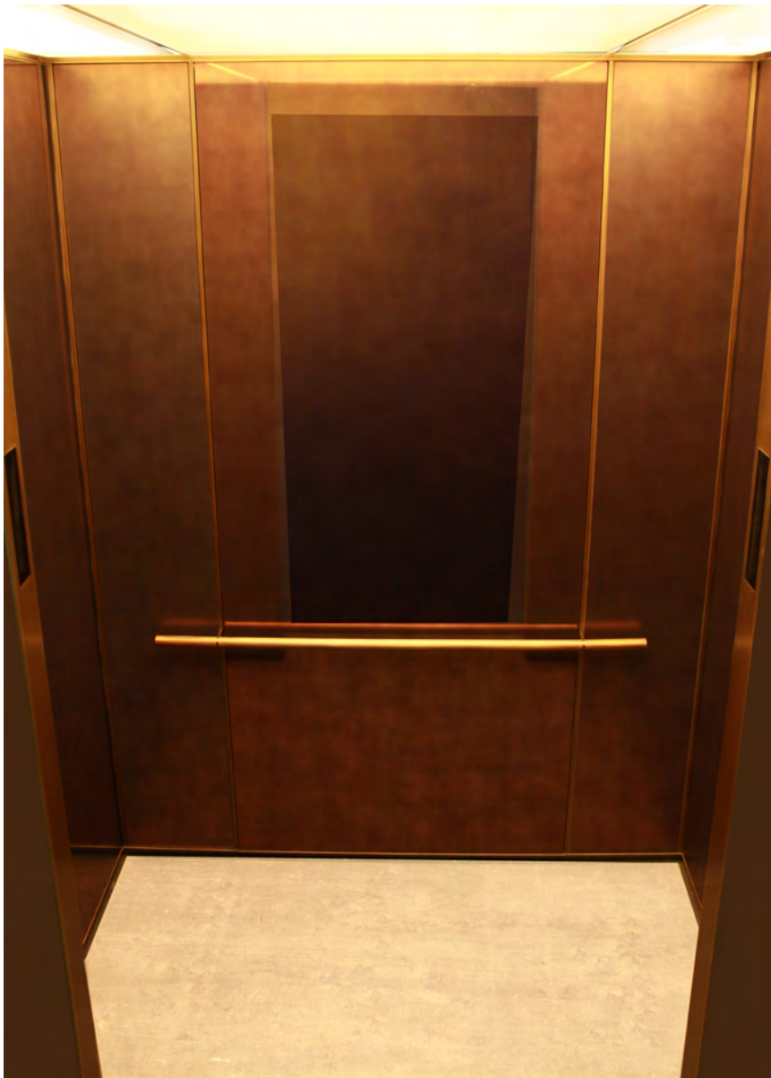
The back and side walls of glass and bronze with patinated bronze railing shown