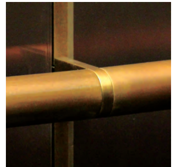
Detail of hand rail and fastener