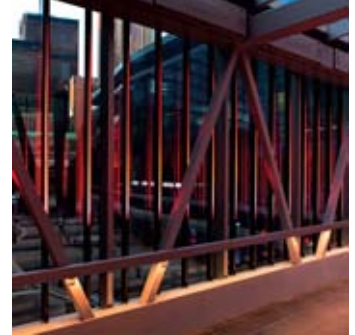
An interior view of the bridge

Highlights - This lighting system is a computer controlled multi-coloured, motion sensitive LED lighting system that has programmed artistic lighting patterns that respond to pedestrians walking through the bridge, creating an interactive experience. Clear tubes run from ceiling to floor holding the LED lights, while the wiring for same is completely hidden. Lighting is also installed beneath the handrails to provide a down-lighting effect.