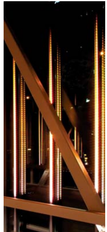
Detail of the LED lights in their plexi-tube casing