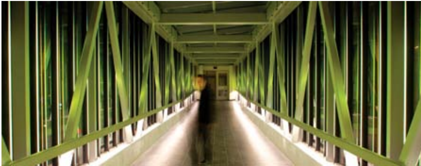
Viewing the bridge interior as lit in the evening