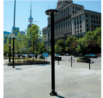
Security camera post on court house grounds.

Highlights - The security camera posts are painted galvanized steel with multiple hi-def cameras installed in each. The security camera posts completely surround the court house. At the top of the posts, four (4) 12" spikes are mounted to each post to deter any damage by birds to the posts. Stainless steel caps protect the electronics from moisture and base plates cover the mechanical fasteners for more protection and improved aesthetic appearance. The posts are painted black and are discreet in their appearance by blending with the other exterior architectural elements also present on the grounds.