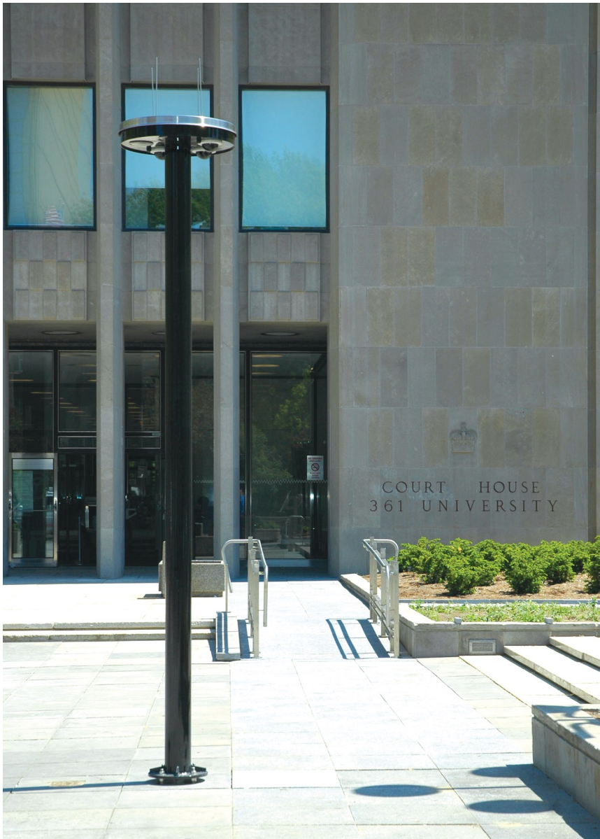
One of the security camera posts located at the front of the Superior Court of Justice in Toronto