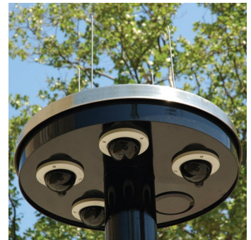
Security camera post with bird deterrent spikes