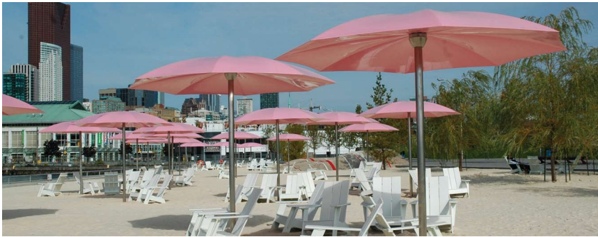
Several of the beach umbrellas against the Toronto skyline