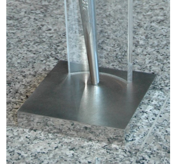
Detail of the display stand base

Highlights - These Olympic Torch Stands feature cut and formed acrylic at 1/4" thickness with stainless steel base and footings. A stainless steel pin is placed at the bottom to secure the torch vertically, while midway up the acrylic there is a custom stainless steel ring to hold the torch horizontally in place. Finish is a mirror polish on top and all sides. Heavy duty ATA style cases with 1/4 " black laminate featuring cut and contoured foam insets and aluminum cross bars were included for travel and storage of the stands when not on display.