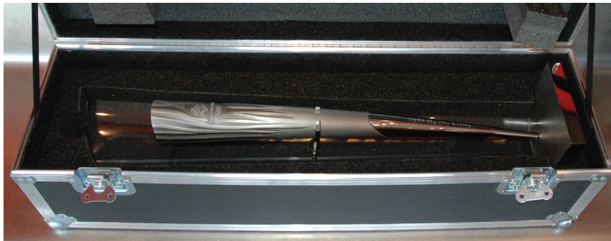
The Olympic torch resting securely in it's custom ATA style case.