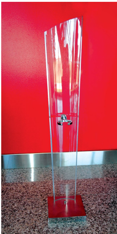
The custom stand on it's own and holding the Olympic torch