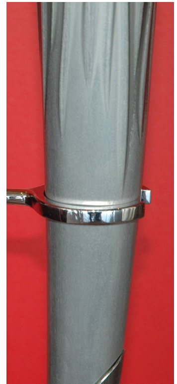
Mirror polished support ring.