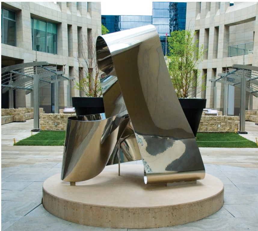
The stainless steel mirror polished sculpture. It stands nine (9) feet tall.