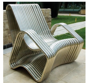
Stainless steel chair in-situ