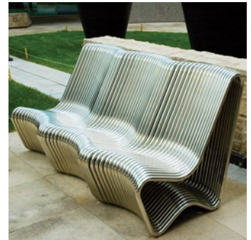
Stainless steel full sized bench in-situ