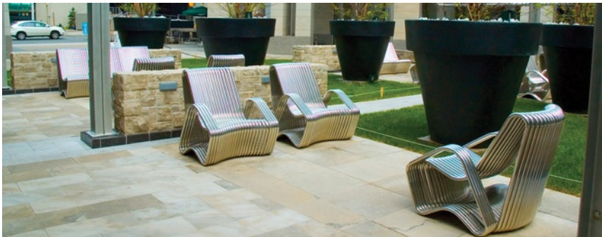
The stainless steel urban furniture pieces in the courtyard

Highlights -The sculpture was fabricated from 1/4" thick x 30" wide formed stainless steel, polished to a mirror finish and mounted to a concrete slab supporting the entire 9' tall structure. The furniture pieces are fabricated from 1-1/4" diameter x 1/16" wall Type 316 stainless steel tubing. The furniture, consisting of large armchairs and benches are placed throughout the courtyard area.. All visible surfaces have a mirror polished finish.