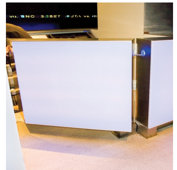
Custom internally illuminated security entrance