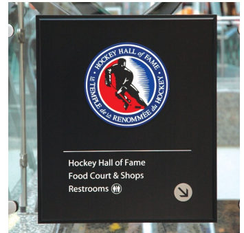
Painted & silkscreened wayfinding sign