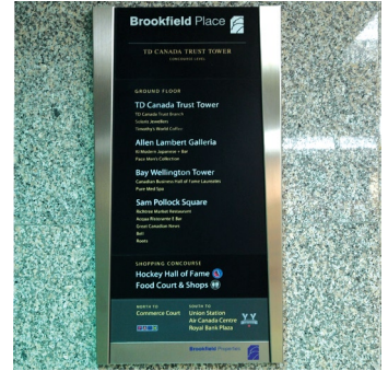
Stainless steel and glass elevator directory

Highlights - These directories and signs are varied in materials and design to suit the location they are in, within the Brookfield Place office complex. Materials range from 1/4" stainless steel and tempered 1/4" glass inserts for the upright brochure holders and directories to modern molded plastics and aluminum for wayfinding signage.