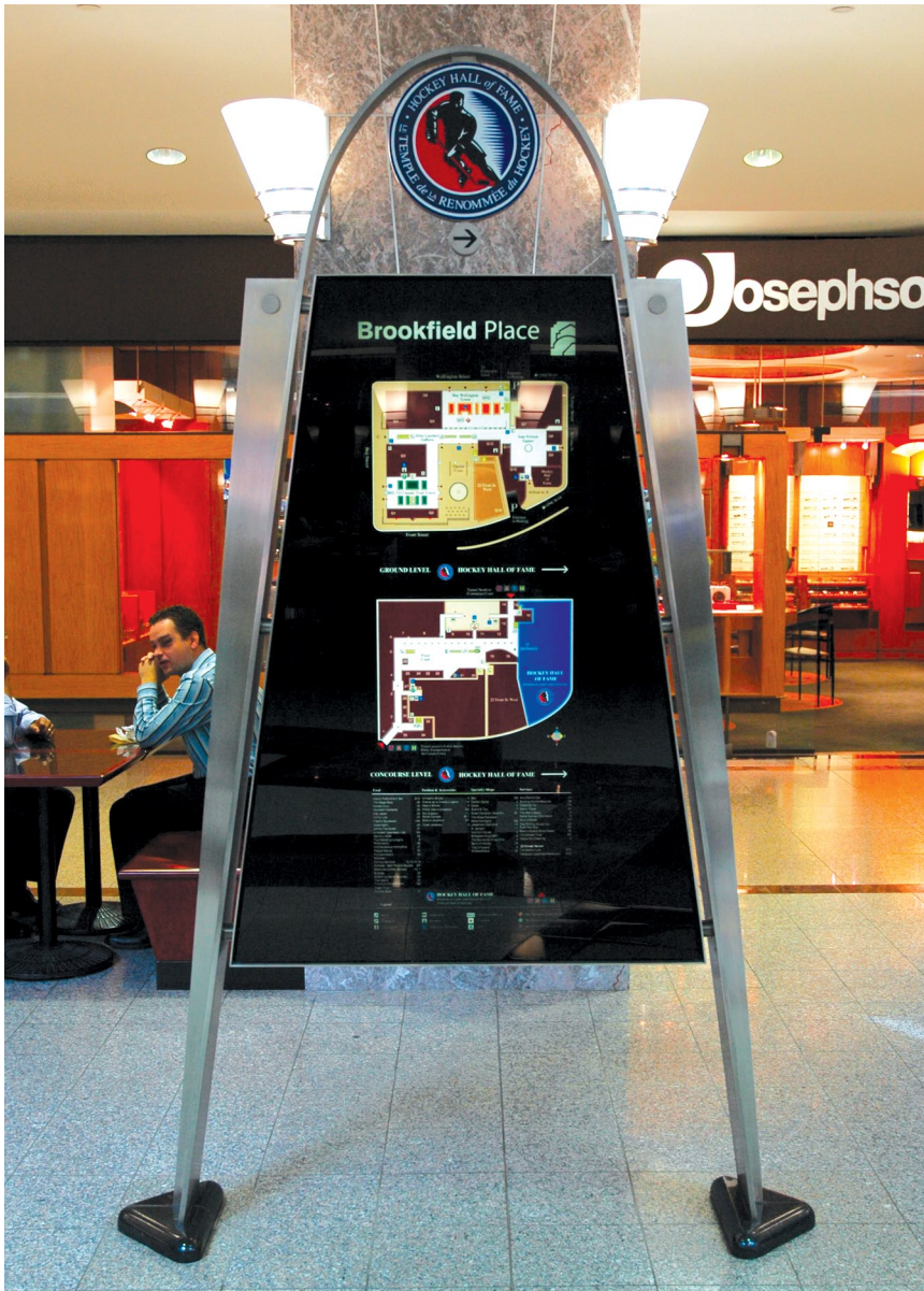
Floor mounted stainless steel & glass directory