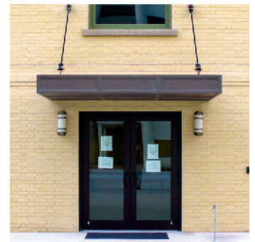
Steel & fiberglass custom patinaed canopy