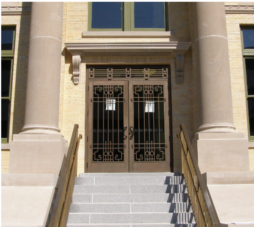
Exterior entrance doors and railings.