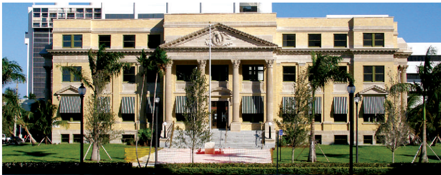
The Historic 1916 Palm Beach County Courthouse

Highlights - Exterior Ornamental Railings - Bronze handrail and posts with patina and lacquer finish Interior Ornamental Railings - Stained Wood posts, painted steel pickets, laser cut decorative motif, powder coated paint finish. (1) Exterior Canopy - Fiberglass and steel construction, with a suspended metallized painted finish (SMF), then orbitally finished and patinaed. (3) Exterior Entrance Doors - Custom aluminum doors, with a suspended metallized painted finish (SMF), then orbitally finished and patinaed. (2) Exterior Aluminum Gates with a painted powder coated finish.