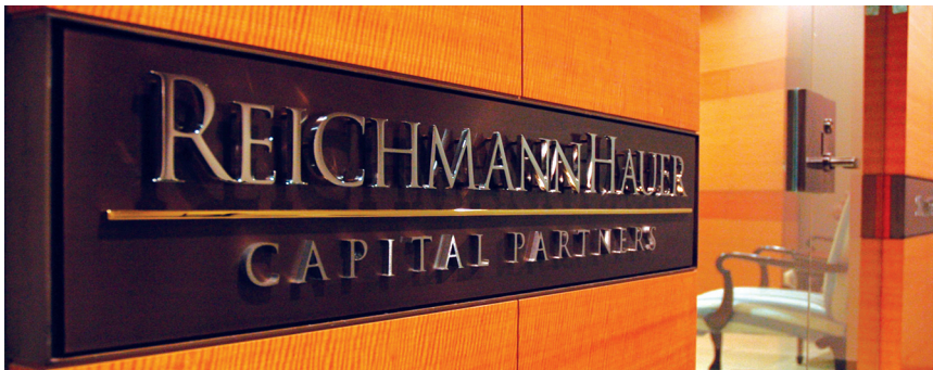
High quality mirror polished finish accented with 24 carat gold plated bronze divider