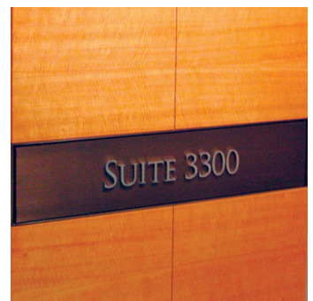
Address identification inlaid into wood panel