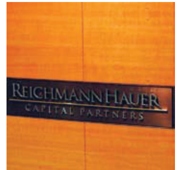
Company identification inlaid into wood panel