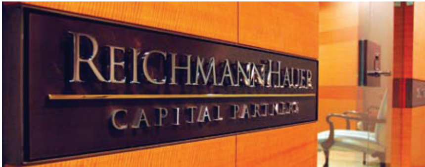
High quality mirror polished finish accented with 24 carat gold plated bronze divider