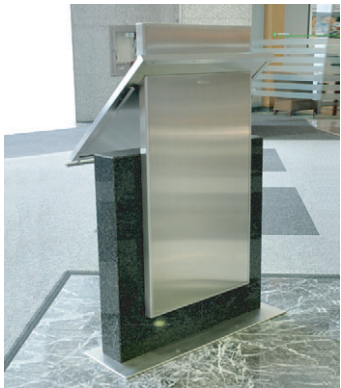
Back of directory featuring brushed st. stl. cladding

Highlights - Directories utilize a welded steel sub-frames, with Nero Impala black granite cladding at the bottoms, stainless steel cladding at the tops, and cantilevered clear glass faces protecting full-color printed maps and tenant information.