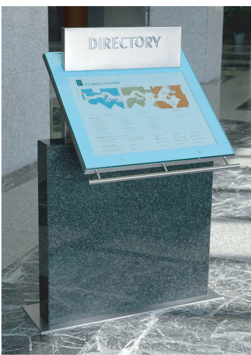
Freestanding directory with st. stl. and Nero Impala black granite cladding as well as cantilevered clear glass face