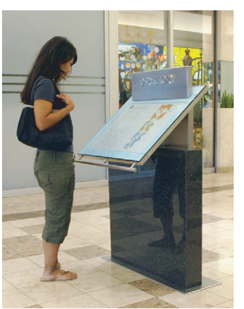
Customer using wayfinding directory