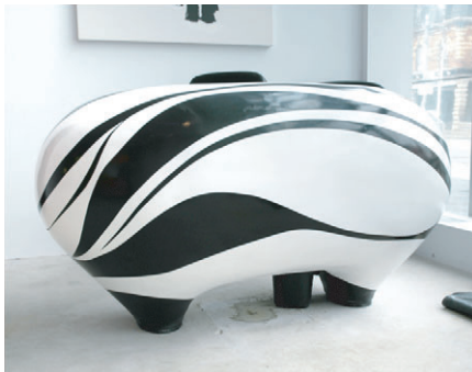
The Tooth reception desk (front view)