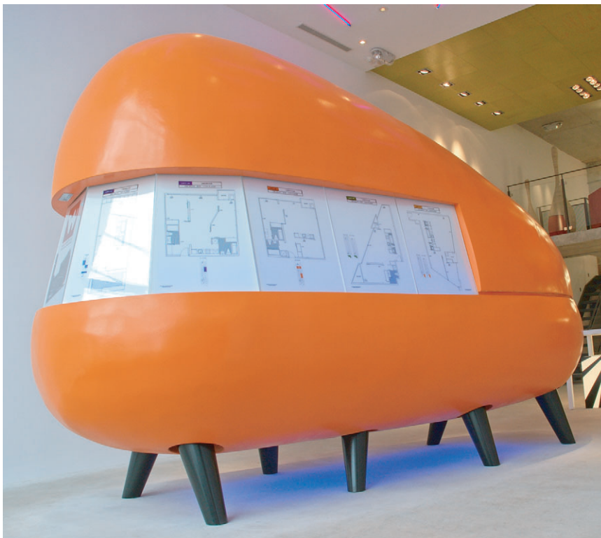
The Blob organic condominium floor plan display unit