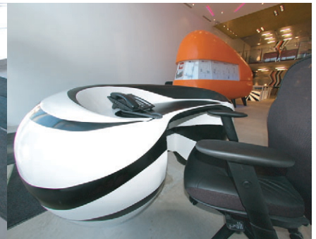
The Tooth reception desk (rear view)