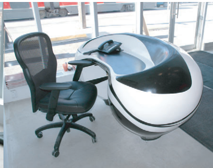
The Tooth reception desk (side view)