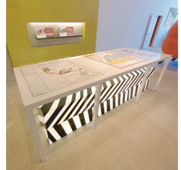
The Box under scale model table

Highlights - The Blob is an approximately 16' long x 9' high x 6' wide organic shape on legs, with backlit graphic windows, computer-controlled, multi-coloured internal LED illumination, and concealed belly-mounted, coloured fluorescent indirect lighting. Construction is a wood framework, over-sprayed with foam, sculpted and sanded, then covered with a sprayed plastic hard shell and painted. The Tooth is a functional and stylish reception desk, using the same wood / foam / plastic / paint system as was used to produce The Blob. The Box is a wood with plastic laminate table designed to support a full-size site plan drawing and a 3-D scale-model of the development, that sits astride a black-striped, internally illuminated, fabricated, translucent white, acrylic box.