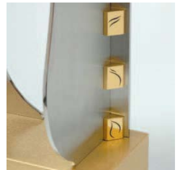
Etched and polished bronze rosettes