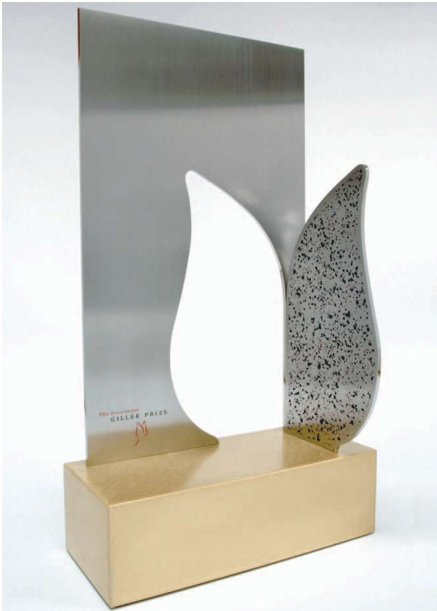
1/8" thick brushed st. steel, waterjet cut, etched and infilled atop an orbitally brushed bronze base

Highlights - Waterjet cut brushed and mirror polished stainless steel plate, etched with a repetitive mosaic pattern and affixed with decorative polished bronze rosettes, all mounted on a brushed bronze base.