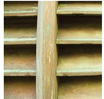
Close up of the louvres and their patina