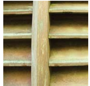
Close up of the louvres and their patina