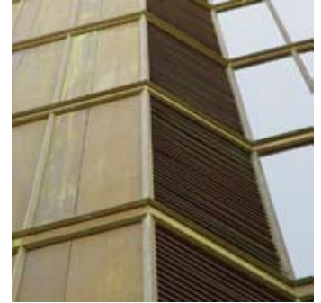
Panels, mullion caps, louvres and trim

Highlights - More than 77,000 linear feet of copper mullion caps and trim were fabricated and patinaed to duplicate the original finish on the building envelope. Using SML's TrueGreen® Patination formula and technique, the design integrity of the original work was upheld while meeting the demands of the remediation. 0.50" rolled copper in 11' lengths was used to complete the mullion caps and trim with individual pieces custom made for spandrels and solid panels that required replacement.