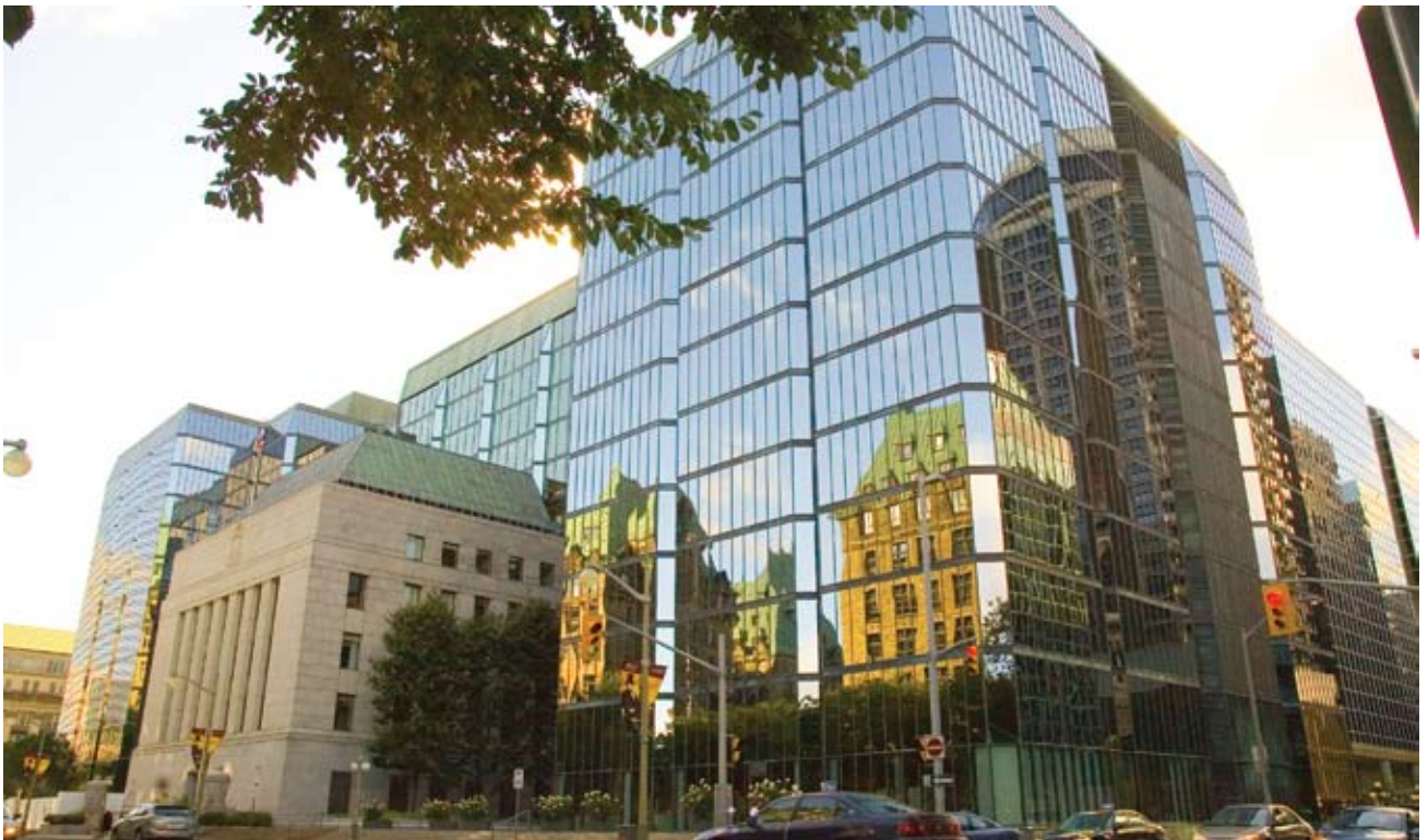
The Bank of Canada in Ottawa had it's glazing system and building envelope replaced in this remediation project