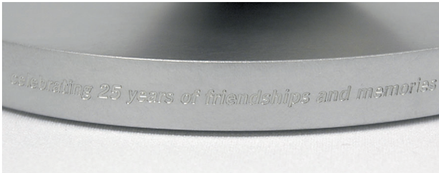
CNC machined graphics