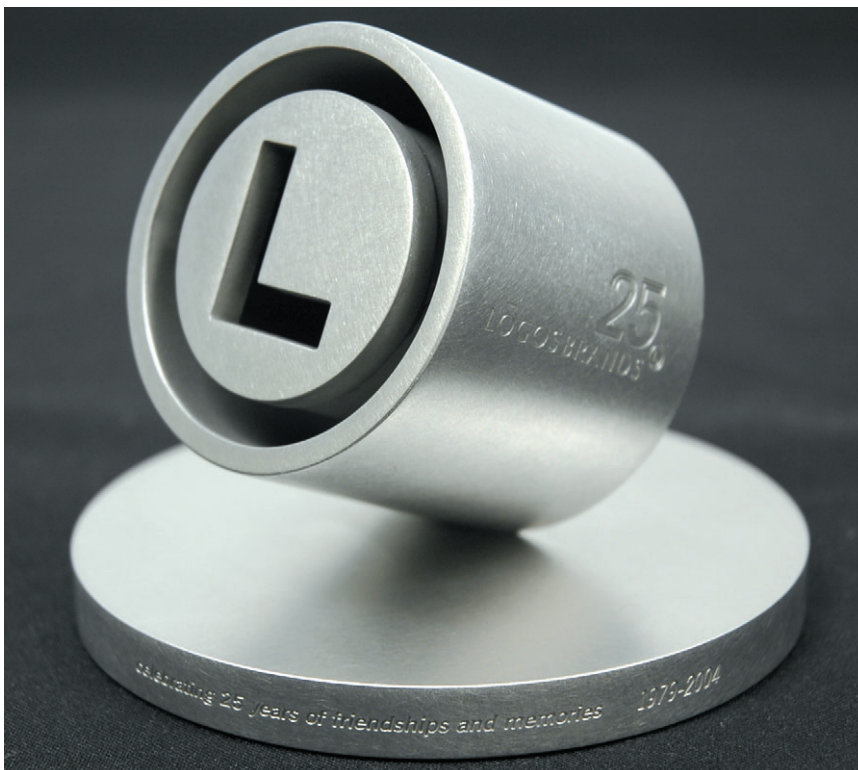
Logosbrands 25th anniversary award made of st. stl. with orbital brushed finish and CNC machined graphics