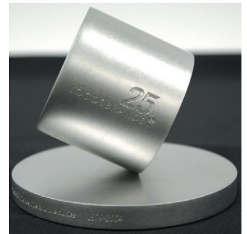
Delicate but solid fastening