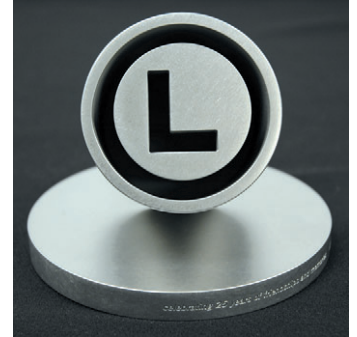
Precisely set elements

Highlights - The award is made of stainless steel with an orbital brushed finish. The body column features a waterjet cut circular disc and "L" shape centered within the column and CNC engraved graphics on the curved side face. The base is a 3/4" thick circular disc also with CNC engraved graphics. Project turn around time was less than one month.