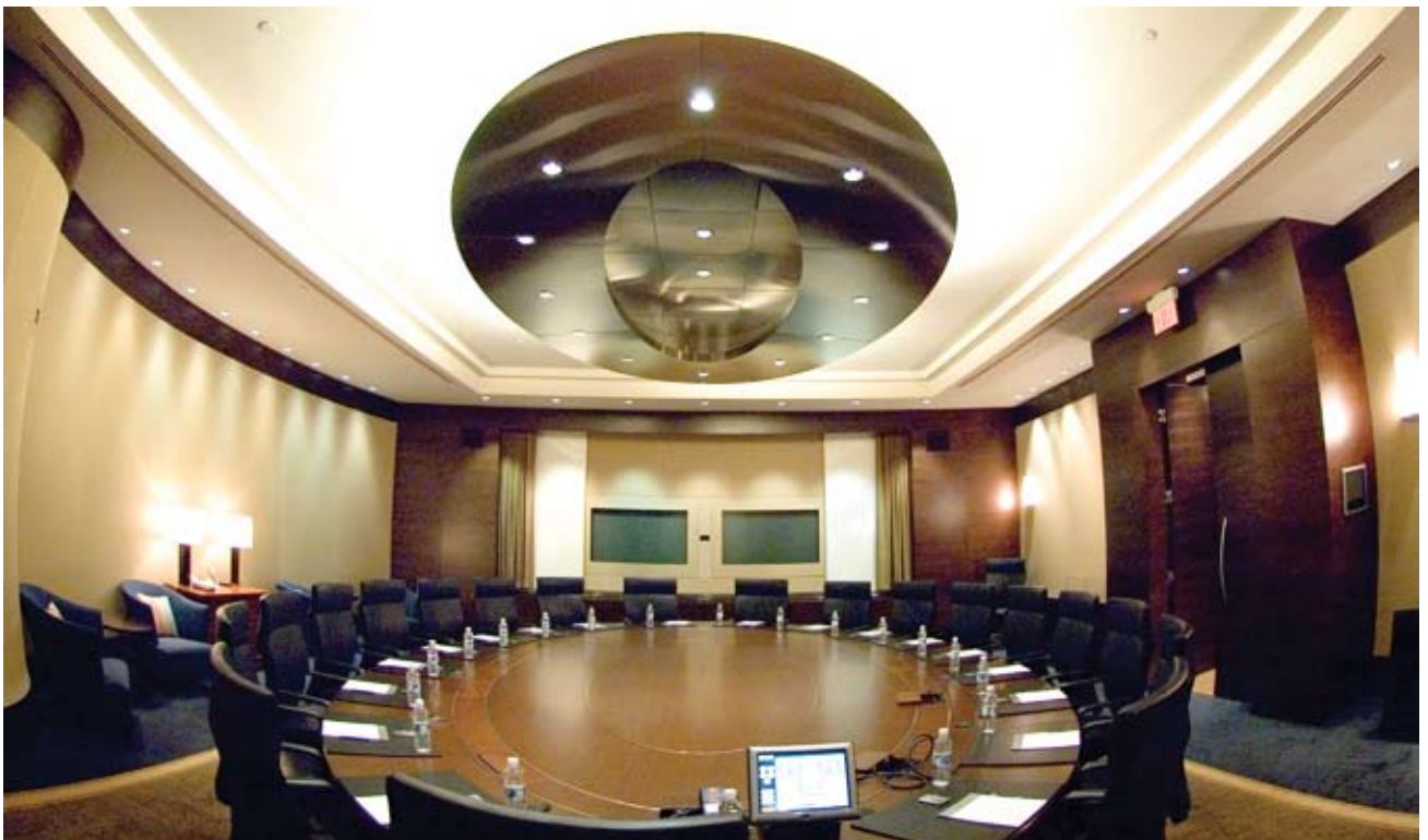
The ceiling fixture installed in the next generation boardroom at the Intercontinental Hotel in downtown Toronto.