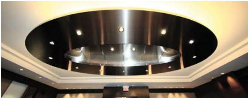
The brushed steel look adds a cool elegance to the boardroom