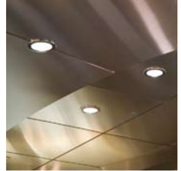
Precision crafted stainless steel

Highlights - Fixtures are XLS brush finish 316 stainless steel laid over acrylic panels then mounted to slabs using (13) 1/2" x 36" steel threaded rods. Pot lights and up-lights provide the central lighting feature to each meeting room. Internally, the fixture contains a remotely operated motorized drop down projection unit.