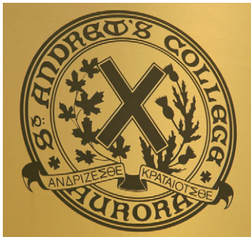
Close-up of etched and patina filled graphic

Highlights - This unique and functional donor wall is made of (25) 1/4" thick solid brushed bronze plates. Each of which are etched with custom graphics, patina filled and lacquer coated in matte finish. The pieces are offset precision mounted to give a floating effect.