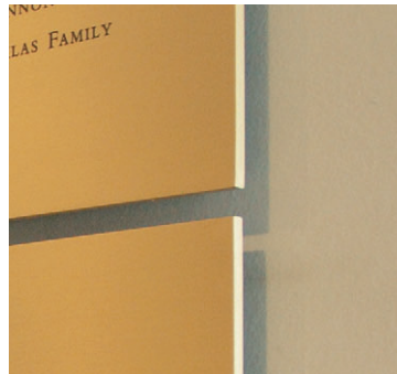
Offset, precision mounted plates give floating effect