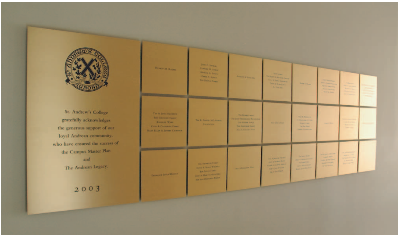
Donor wall made of (25) solid brushed bronze plates