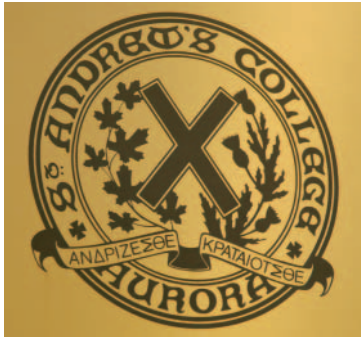
Close-up of etched and patina filled graphic

Highlights - This unique and functional donor wall is made of (25) 1/4" thick solid brushed bronze plates. Each of which are etched with custom graphics, patina filled and lacquer coated in matte finish. The pieces are offset precision mounted to give a floating effect.