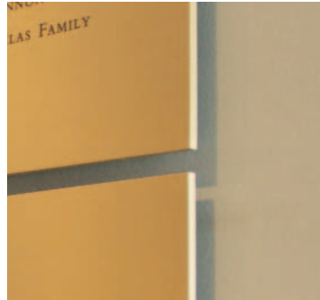
Offset, precision mounted plates give floating effect