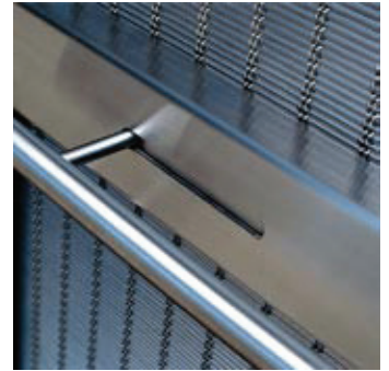
Sliding latch assembly