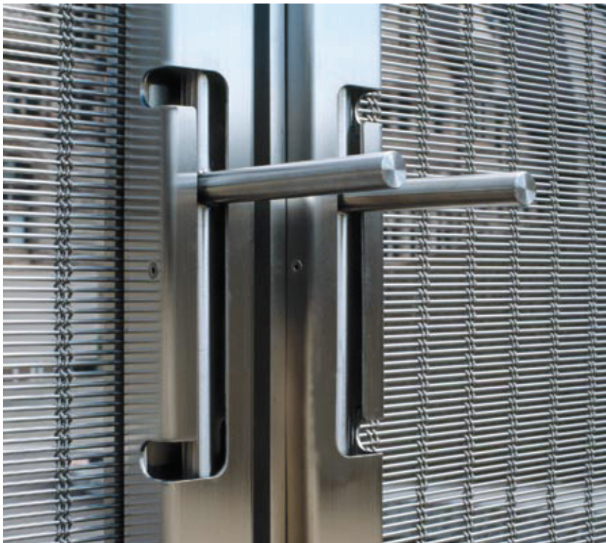
Down-bolts on south ramp gates