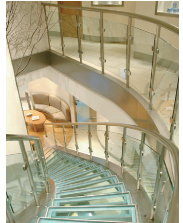
Monumental stainless steel staircase

Highlights - This beautiful custom monumental staircase features glass treads, five different curved radii, glass panels, stainless steel balustrades and precision welding.