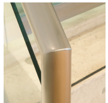
Precision welded and finished guardrail cover