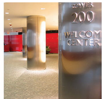
Stainless steel column covers