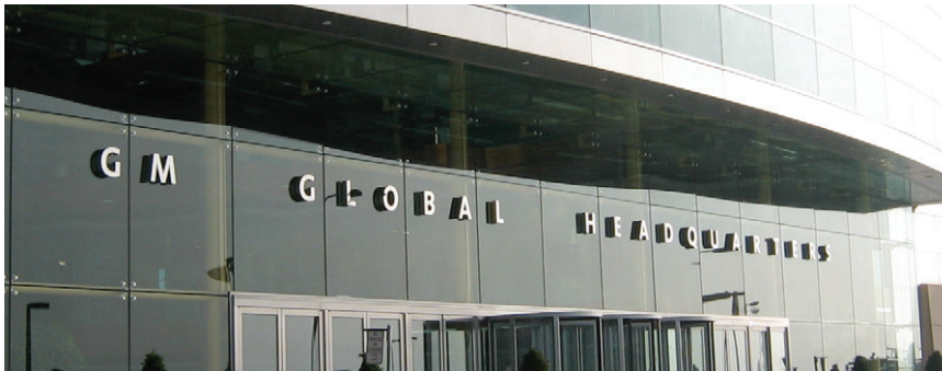
Exterior front signage made of stainless steel