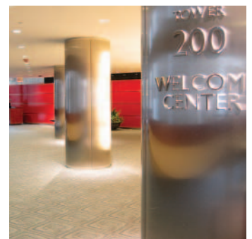
Stainless steel column covers