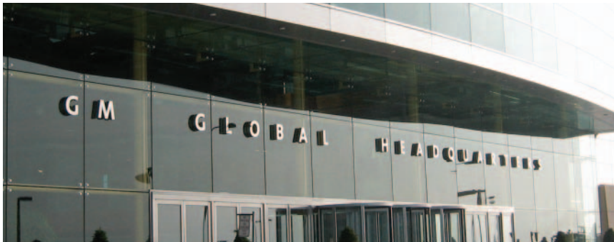
Exterior front signage made of stainless steel