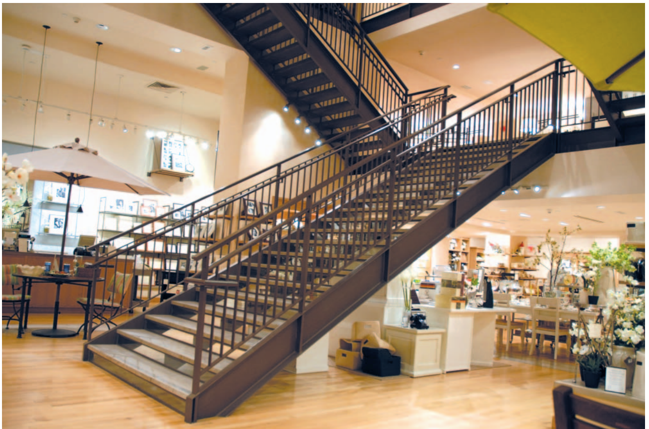
Painted steel staircases with concrete filled pan type treads and glass risers