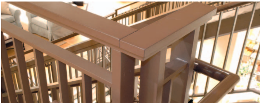
Detail of corner post showing precision welded joints and quality paint finish