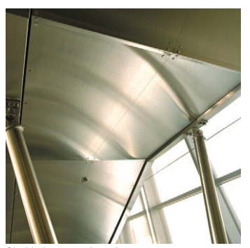
Cladded structural steel