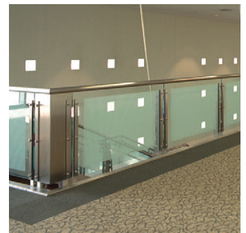
Custom designed corner detail