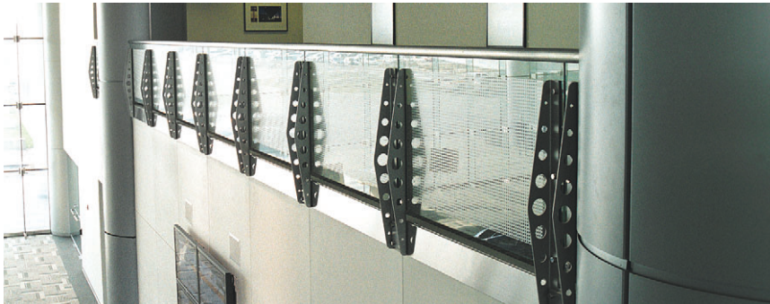
Fritted tempered glass panels

Highlights - Field dimensions yielded slab alignment variances in excess of 4" off plumb. Our designers and site forces overcame this problem by introducing structural shims that resulted in a "gun barrel" straight installation. Over 200 fritted glass panels and 1300 lineal square feet of balustrades.