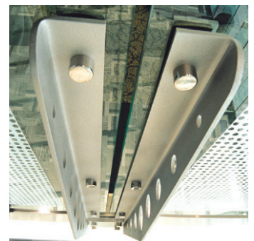
Custom stainless steel posts - shot blasted finish