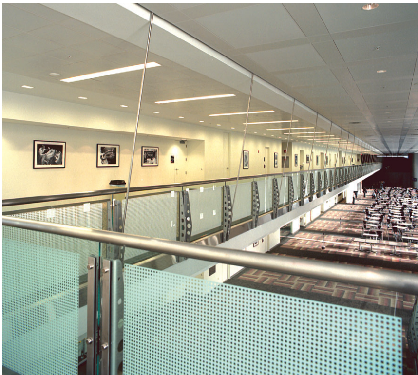
Cantilevered floor supported by stainless steel suspension rods