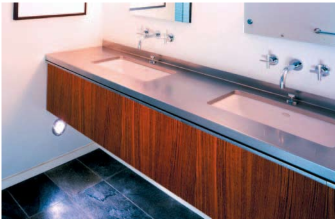
Brushed stainless steel bathroom countertop

Highlights - Stainless steel glass bridge is complete with etched glass balustrade. Edge lit stairs with 3/4" thick seamless stainless steel stringer complete with Jatoba wood treads and risers and machined s/s oval handrail.