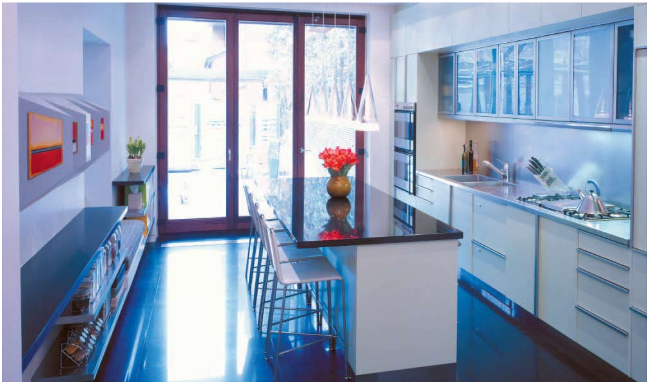
Stainless steel kitchen countertop and cabinets