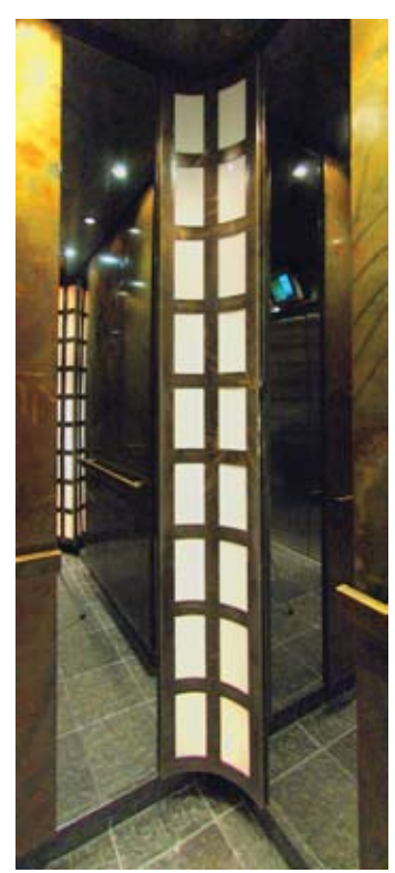
Thermal formed plexi-glass lighting lenses