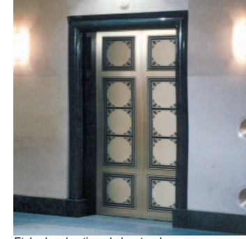
Etched and patinaed elevator doors