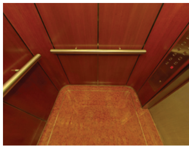
Stainless Steel Handrails & Granite Flooring