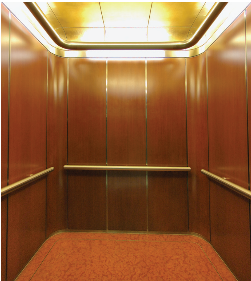
Full View of the Cab Interior.