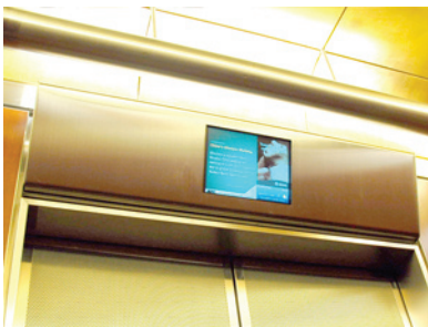
Custom Built Display Housing

Highlights - Features include aluminum ceilings enhanced with 23 carat gold leaf, anigre veneer panels, stainless steel handrails, stainless steel reveals, compact fluorescent energy efficient up-lighting, wire mesh stainless steel doors, segmented digital position indicator and custom built stainless steel display housing.