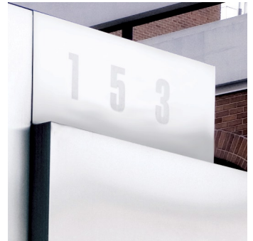
Etched address identifier