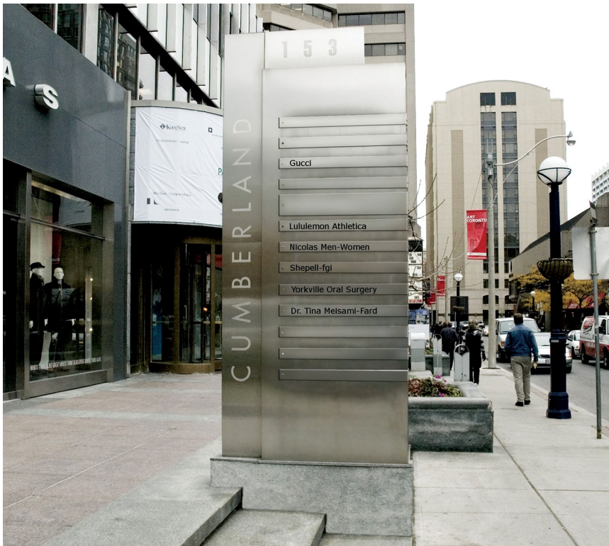
Facing west, the Pylon sign dominates and compliments surroundings