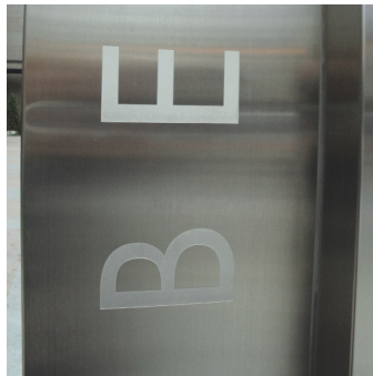
Precision acid etching