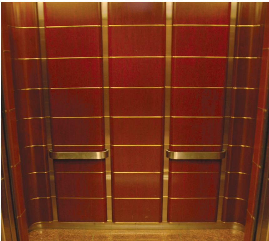
Warm cherrywood veneer paneling with stainless steel reveals and extruded brass accents