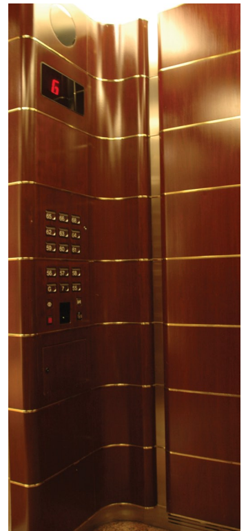
Cherrywood veneer COP