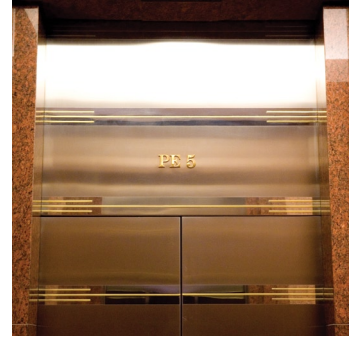
Exterior stainless steel and brass doors detail

Highlights - These cabs feature Cherrywood veneer paneling throughout the interiors with stainless steel reveals. Brass inlays accent the entire cab and exterior doors. On each panel at the top and bottom there is a 1/4" brass plate. All inlaid brass extrusions are 1/4" which wrap contiguously throughout the cab. Transom is stainless steel, alloy 316 XL blend(S) finish. Ceiling is dropped, mirror polished stainless steel and flooring is polished red marble. Hand rails are stainless steel rolled and mounted so that there are no anchors showing. cove lighting is used to illuminate the interiors without any fixtures showing.