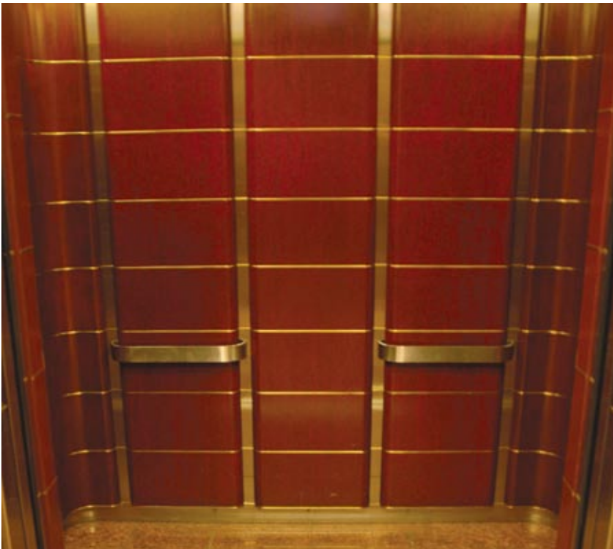
Warm cherrywood veneer paneling with stainless steel reveals and extruded brass accents