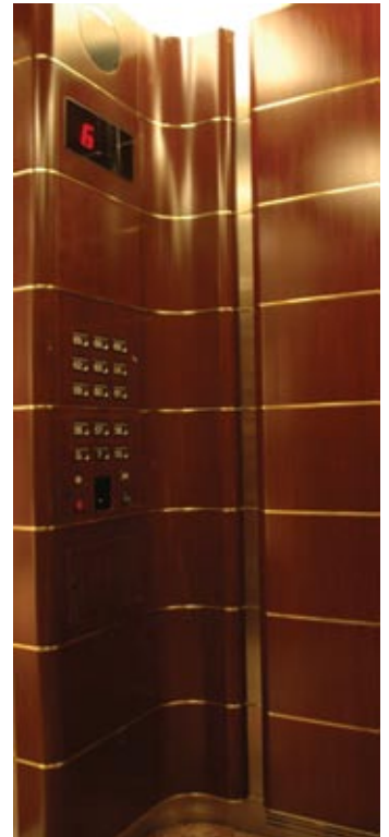
Cherrywood veneer COP