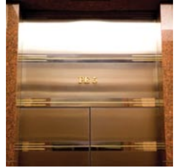
Exterior stainless steel and brass doors detail

Highlights - These cabs feature Cherrywood veneer paneling throughout the interiors with stainless steel reveals. Brass inlays accent the entire cab and exterior doors. On each panel at the top and bottom there is a 1/4" brass plate. All inlaid brass extrusions are 1/4" which wrap contiguously throughout the cab. Transom is stainless steel, alloy 316 XL blend(S) finish. Ceiling is dropped, mirror polished stainless steel and flooring is polished red marble. Hand rails are stainless steel rolled and mounted so that there are no anchors showing. cove lighting is used to illuminate the interiors without any fixtures showing.